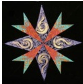
Step 2- Add arrowheads