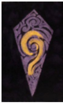
Highlighting- gold added by painting over the curved shape