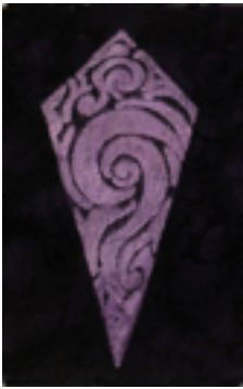
One color (Kite shape)