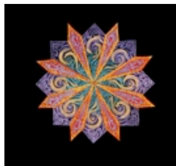
Step 2 - add 8 neckties in the spaces between kite shapes.