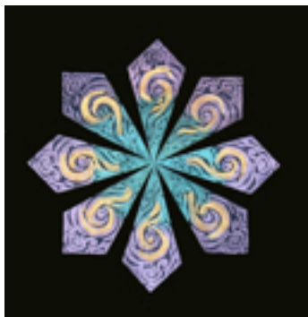
Step 1 - kites