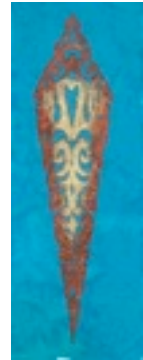
Outlining (Necktie shape)