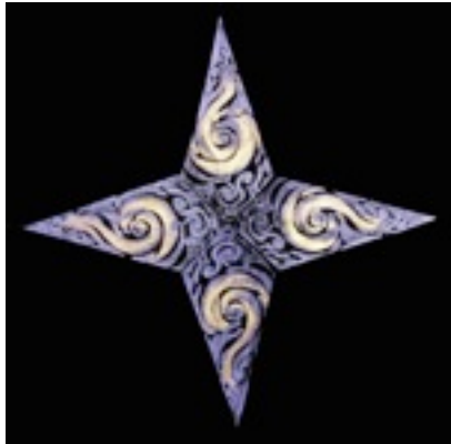
Step 1- kites