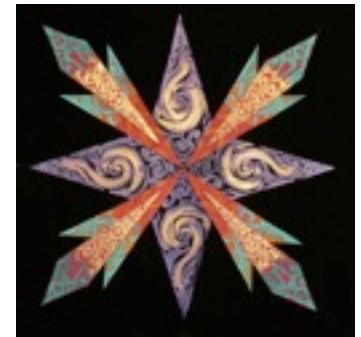
Step 3 - Add neckties