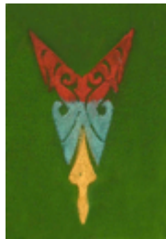
Parfait layers (Arrowhead shape)