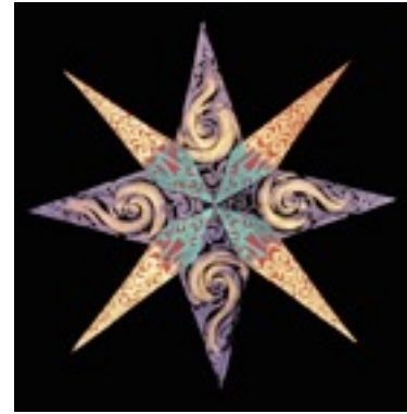
Step 2- Add neckties