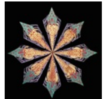
OR layer neckties on top of kites.